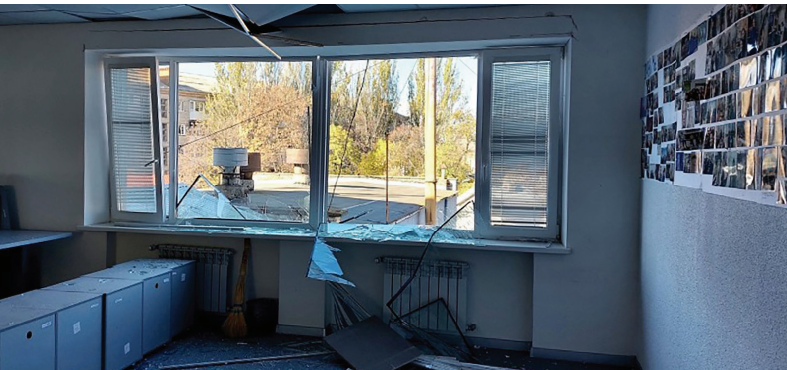
MDEM office in Mykolayiv damage

Neighboring multistoried buildings and MDEM office appeared in the range of the blast wave. On the second and the third floors of the office building the windows were broken from the side of explosions, besides there was internal damage, such as extruded internal doors, glass partitions, as well as damage to the ceiling. On the fourth, fifth, sixth floors some windows from the explosion side were also broken, the window frames damaged, - the destruction is more cosmetic, but requires the replacement of a significant part of the metal-plastic windows outside and inside the building doors to the rooms on the floors. Luckily no people were in the office building.