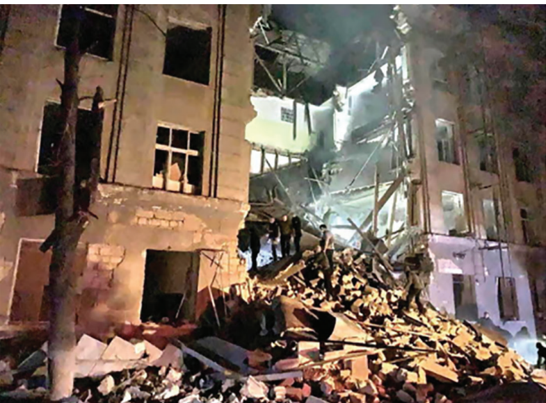
The Mykolayiv Polytechnic College