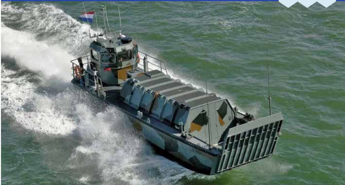
» PICTURE OF SIMILAR VESSEL