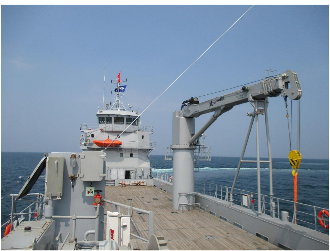
© Damen Trading & Chartering (DT&C). Unauthorized use and/or duplication of this material without express and written permission from DT&C is strictly prohibited. Excerpts and links may be used, provided that full and clear credit is given to DT&C with appropriate and specific direction to the original content.