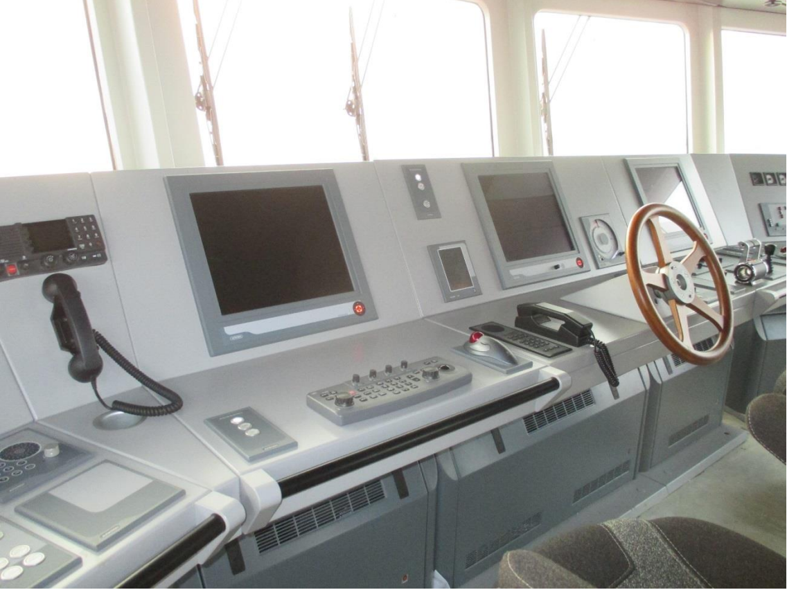
© Damen Trading & Chartering (DT&C). Unauthorized use and/or duplication of this material without express and written permission from DT&C is strictly prohibited. Excerpts and links may be used, provided that full and clear credit is given to DT&C with appropriate and specific direction to the original content.