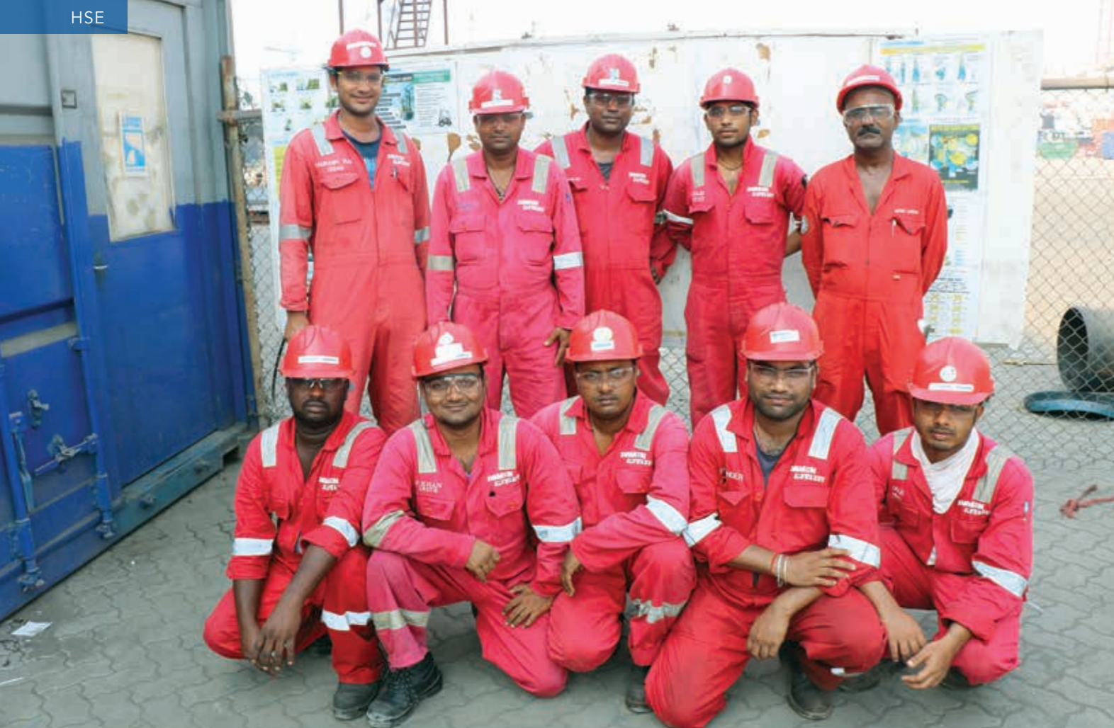
THE FIRE SAFETY TEAM AT ALBWARDY DAMEN - SHARJAH